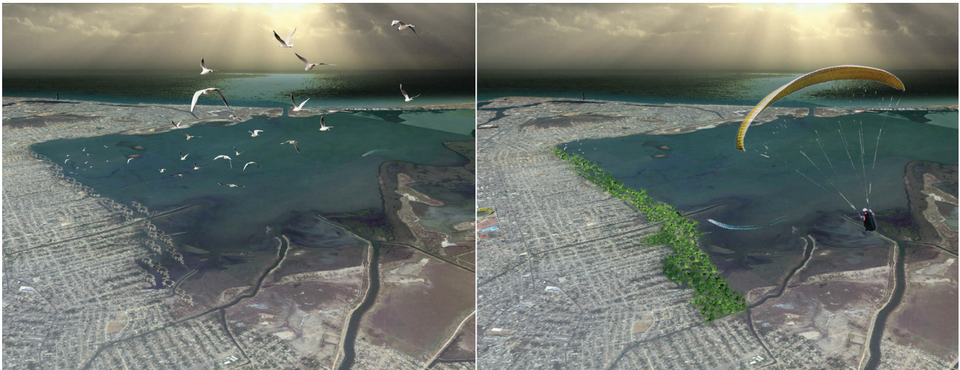
Figure 5: Rhizolith Island Urban Speculation, shoreline of Cartagena, Colombia.

combination of concrete mixes to encase planted mangroves, while concrete fins below water create new habitats. The individual concrete modules aggregate into island clusters that can then aggregate into even larger, buoyant fields that act as a soft breakwater. The field aggregations also have the potential to become a larger, public infrastructure for urban growth. When the islands aggregate to a field, variation in the pattern creates gaps for boats and kayaks to pass through the islands, as well as for marine enthusiasts to enjoy the living breakwater as a place for recreation; added value to the growth of the urban spaces the breakwater intends to protect. Over time, the concrete elements survive long enough to protect the mangroves as they mature but are designed to fail so mangrove roots can easily moor into the seabed. As the roots break the elements, they sink to the seabed. Since concrete is rich in calcium, due to the limestone content of the cement, the elements will also help to support the growth of coral reefs that adjoin the lagoon.