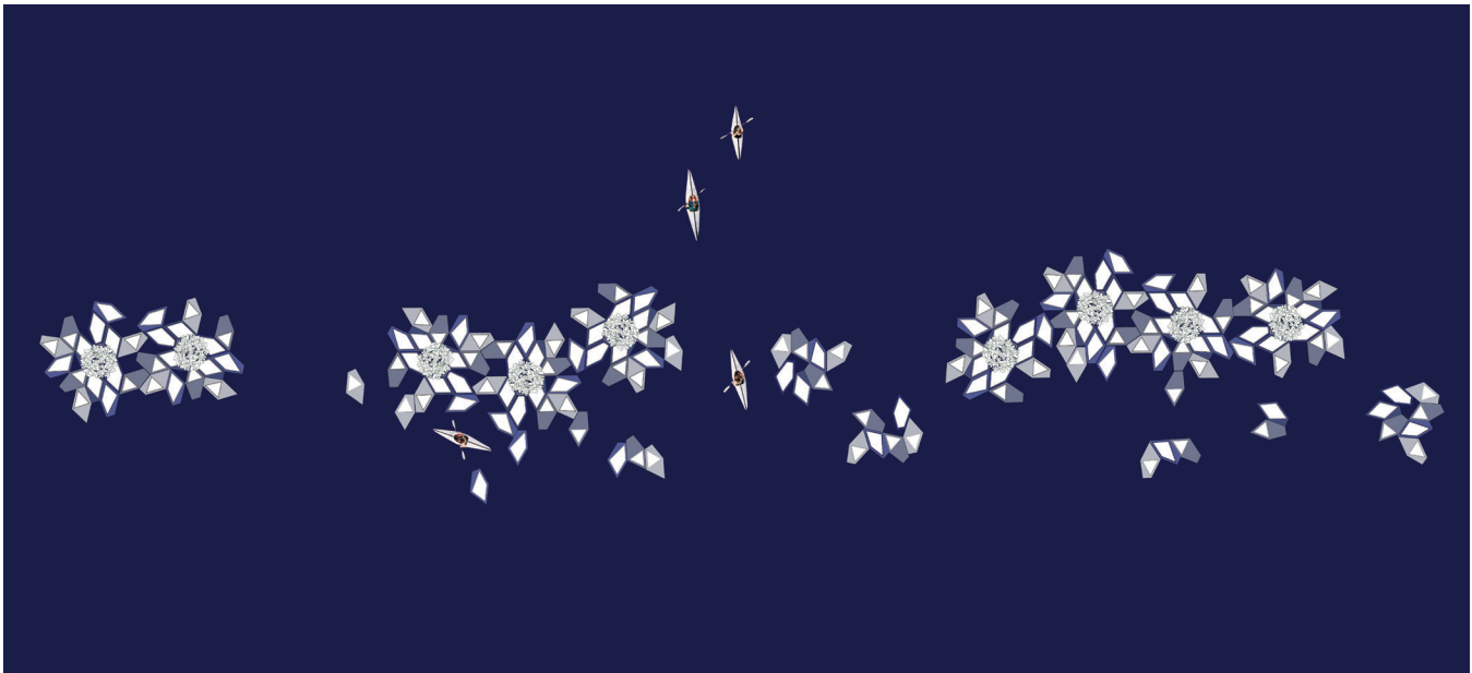
Figure 3: Aggregation of elements into larger field condition