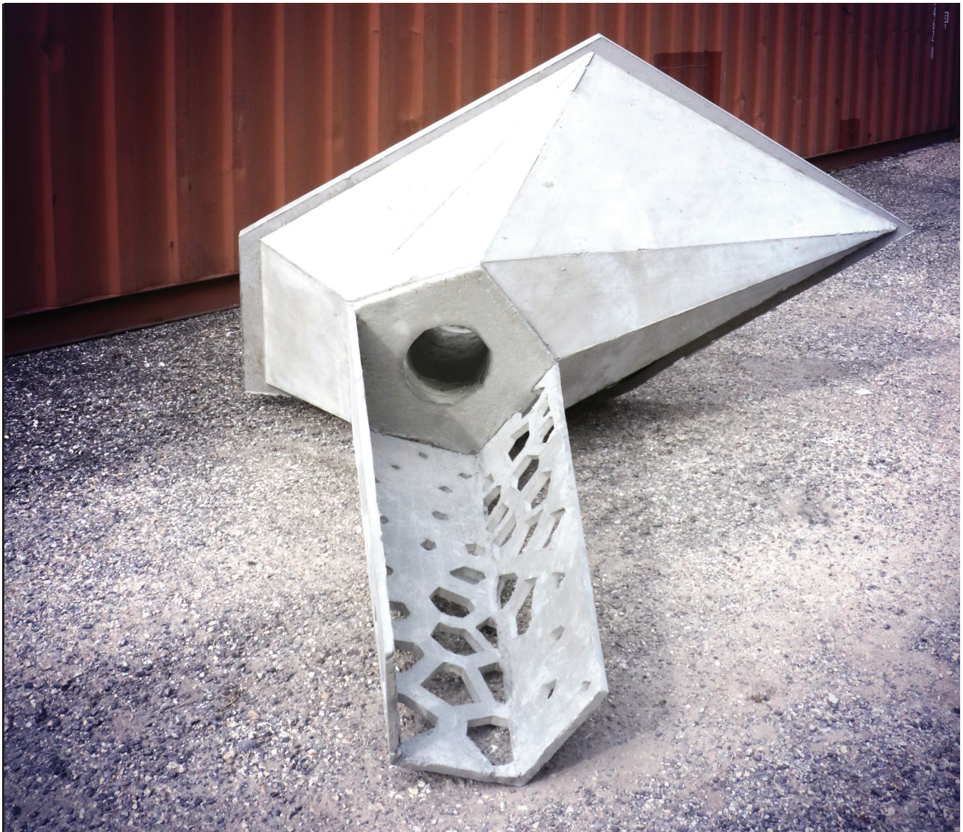
Figure 4: Single Rhizolith Island element, 10-20 of these elements make up one island.

is conceptually aimed to begin as an artificial rhizolith that slowly returns to a natural, fossilized form of rhizolith over time. The design of the breakwater prototype, as an ‘artificial root system,’ is comprised of ‘root-like’ concrete modules that work like an artificial rhizolith. It begins as a completely artificial, concrete structure but eventually ‘fossilizes’ and is taken over by the mangroves; thus, bringing the ‘rhizolith’ back to a natural state.