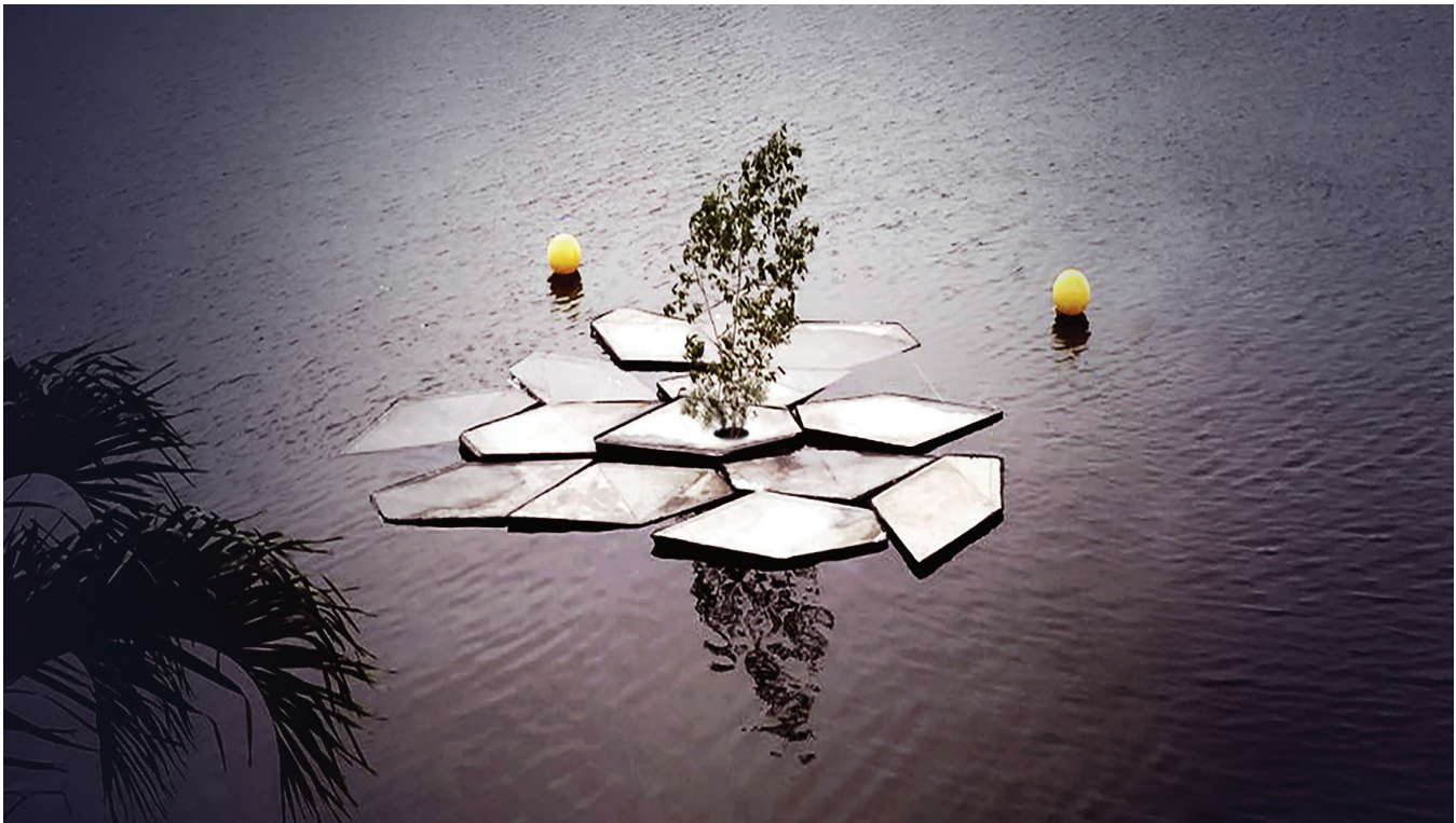
Figure 1: Rhizolith Island first prototype, exhibited in Cartagena, Colombia